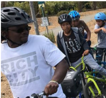
RICH CITY RIDES/COOP RICHMOND

Seed Commons channels investment to marginalized communities that have faced the brunt of the extractive economy, deindustrialization, and systemic discrimination, making community-controlled finance available to cooperatively-owned businesses that create jobs, build wealth, and challenge inequality.