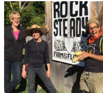
ROCK STEADY/HUDSON VALLEY

Seed Commons: A Community Wealth Cooperative | seedcommons.org